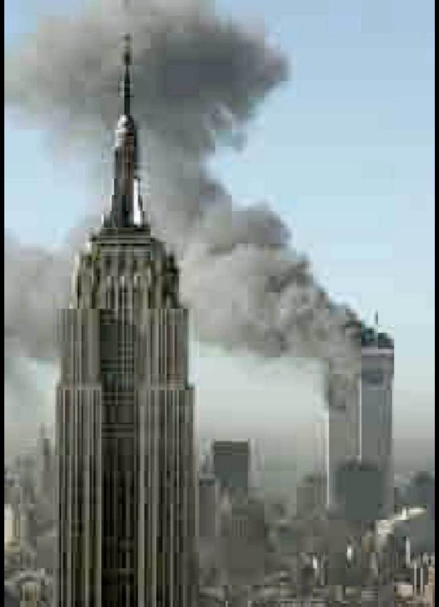
Thomas Ruff, jpeg ny01 , 2004, C-print.