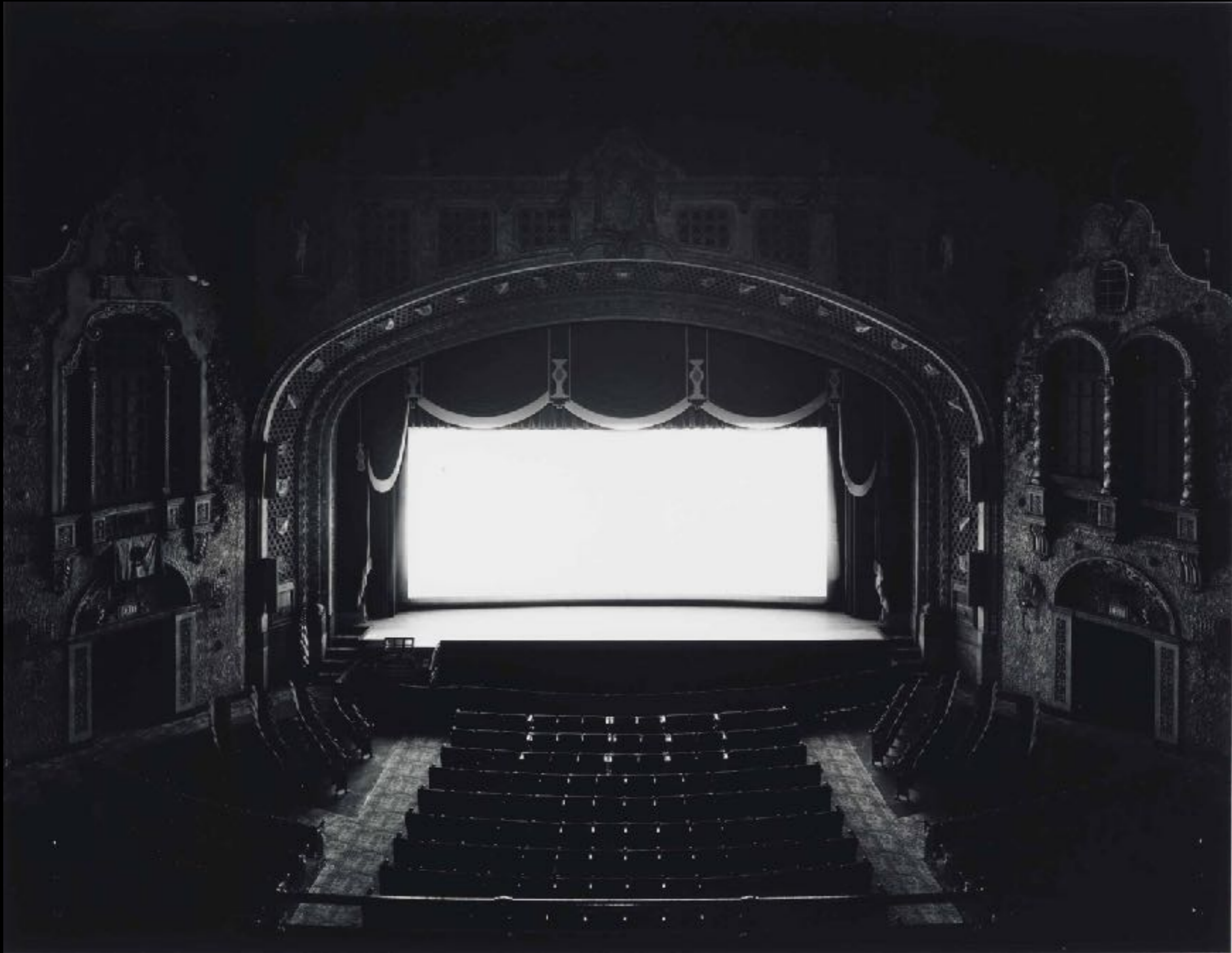
Hiroshi Sugimoto Marion Place, Ohio, 1980