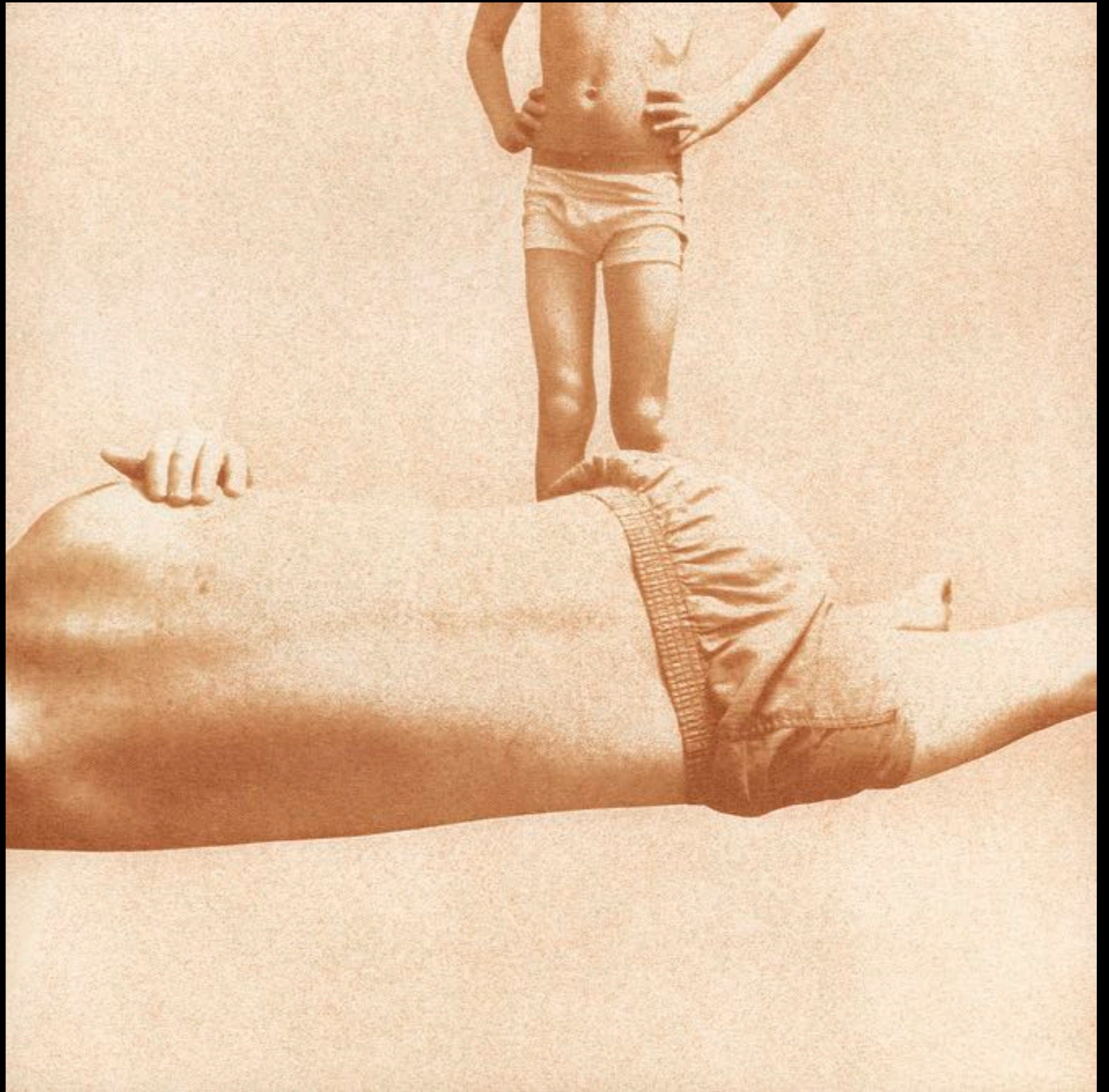
Marina Berio family matter 3, 2008/2013 gum bichromate print with blood 10.2 x 10.2 in. / 25.5 x 25.5 cm.