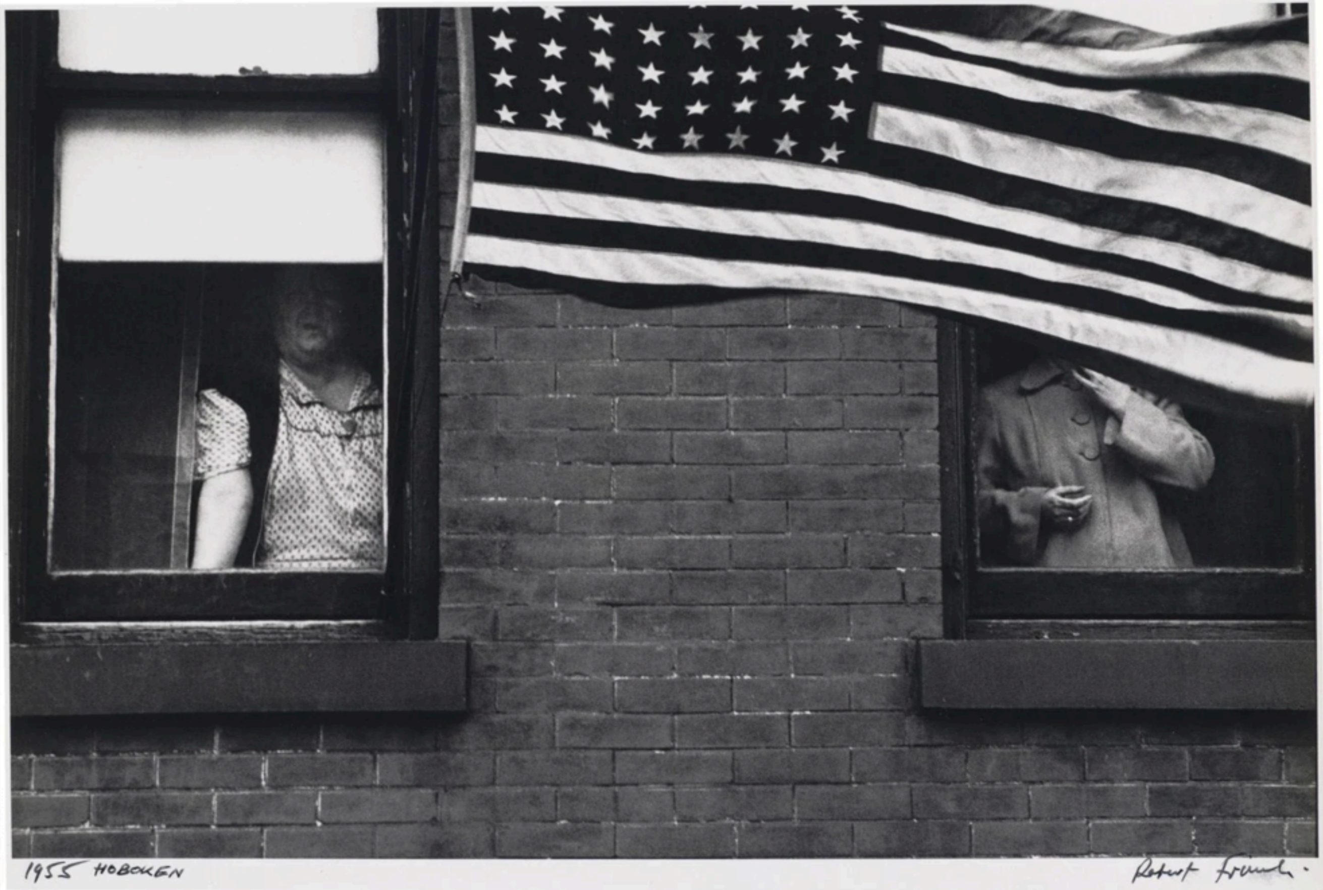
"Parade — Hoboken, New Jersey," 1955