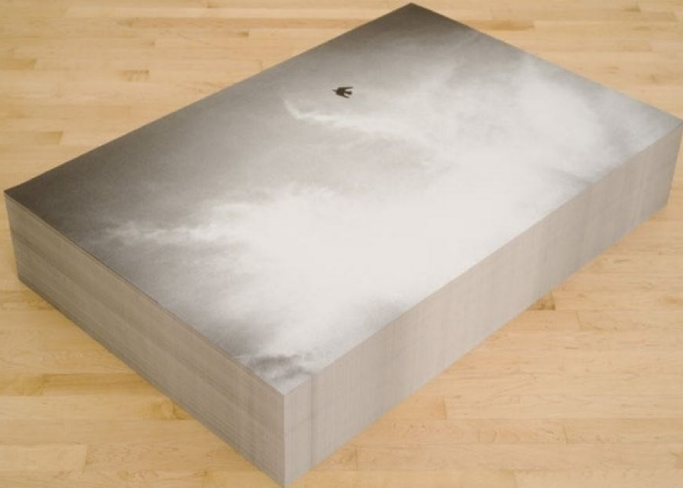
Felix Gonzalez-Torres "Untitled" (USA Today), 1992 - 1993 print on paper, endless copies, 8 in at ideal height x 48-1/4 x 33-1/4 (original paper size)